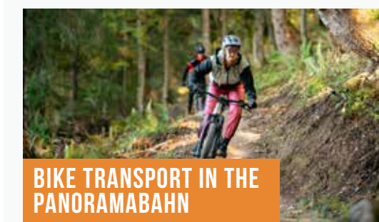
BIKE TRANSPORT IN THE PANORAMABAHN