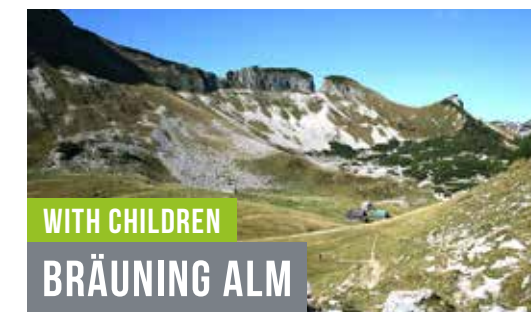
WITH CHILDREN BRÄUNING ALM

Panoramabahn mountain station at 1,600 m above sea level Trail: 1