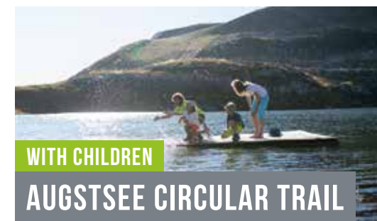
WITH CHILDREN AUGSTSEE CIRCULAR TRAIL

Panoramabahn mountain station at 1,600 m above sea level Trail: 3, 256, 255